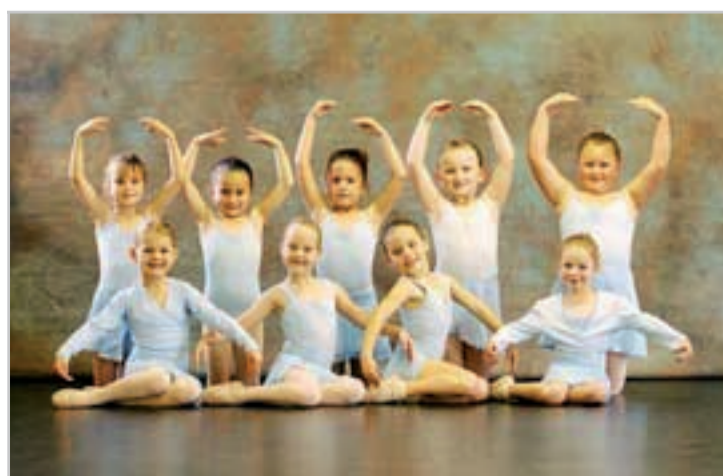
■ The Grade 1 Ballet Class shows us its fine form.

"Being allowed to take photographs in Nicole's studio al-